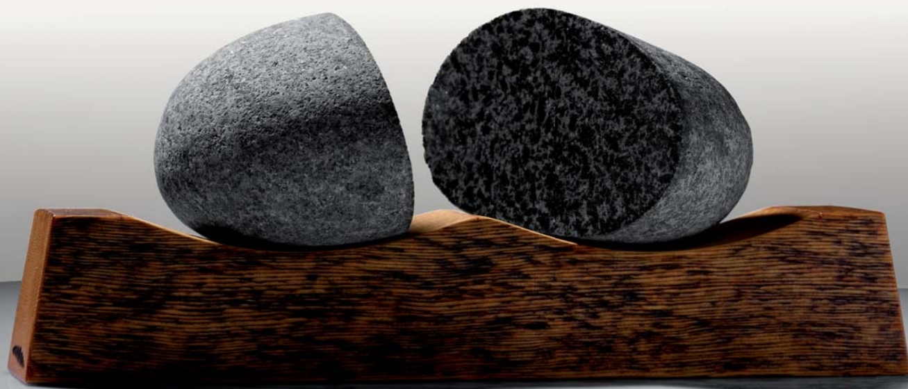
Sculpture Image: Peter Whyte